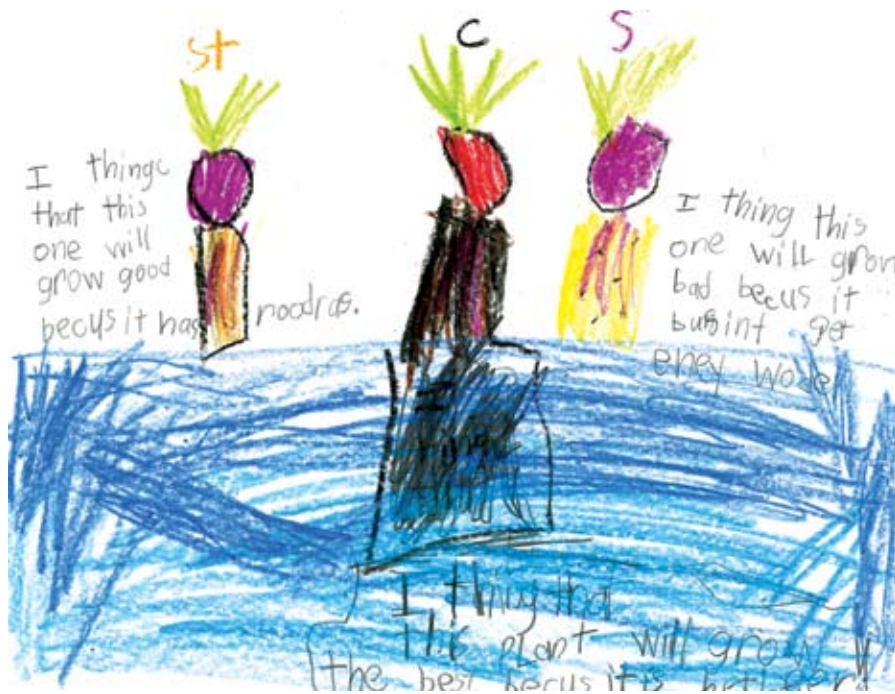
Students made predictions of how their radish plants would grow in different soils.

content, soil rich in organic matter forms water-stable soil aggregates, which are more resistant to the forces of erosion (Six et al. 2002). Water-stable aggregates are secondary soil particles (larger than sand, silt, or clay) composed of organic materials and inorganic mineral particles. These aggregations are more resistant to the forces of erosion because the particles are tightly bound together, primarily by the organic materials that form “bridges” between inorganic particles.