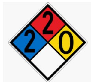
NFPA 704 Diamond