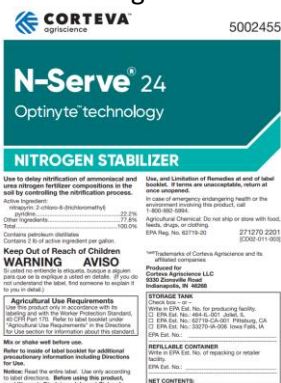
Example - Product Label / Booklet

The Corteva Agriscience product label incorporates a product booklet and tank label in a single, adhesive backed design.