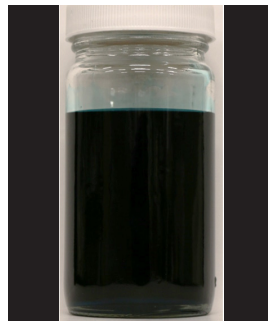
Figure 1: Stinger HL

Perform a jar test prior to tank mixing to ensure compatibility of this product and other pesticides. Use a clear glass quart jar with lid and mix the tank mix ingredients in the required order and their relative proportions. Invert the jar containing the mixture several times and observe the mixture for approximately 30 minutes. If the mixture balls-up or forms flakes, sludges, gels, oily films or layers, or other precipitates, it is not compatible and the tank-mix combination should not be used.