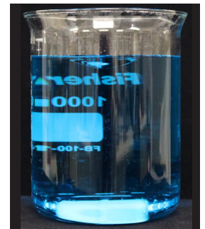
Figure 3: Stinger HL added to water after agitation