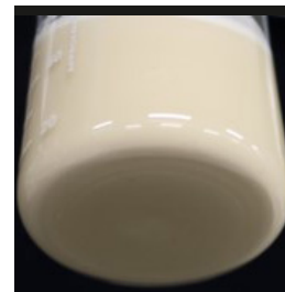
Figure 3: Tarzec after two minutes of agitation