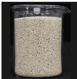
Figure 1: Tarzec is formulated as water dispersible granules (WDG)

Note: Rinsate may be disposed of onsite according to Tarzec label use directions or at an approved waste disposal facility.