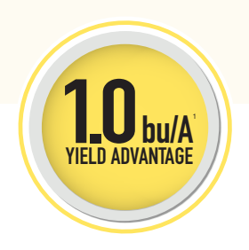
Yield benefit shown in 638 trial locations*

Protect your soybean plants from the number-one yield-robbing disease in soybeans, Phytophthora. In multi-year field trials across the U.S., Lumisena® fungicide seed treatment has been proven to significantly boost yields and plant stands under Phytophthora pressure versus the existing industry-standard seed treatment.