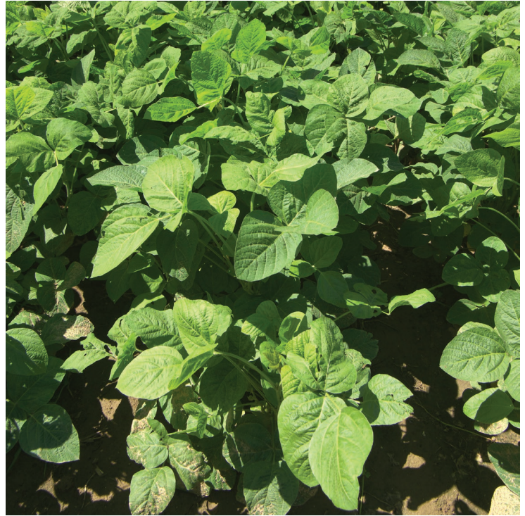
Chart 1. Application Rates and Timing

Intrepid® 2F insecticide has demonstrated outstanding control of soybean loopers, velvet bean caterpillar and saltmarsh caterpillar in trials with competitive products. Examples of this research are shown in the two charts on the back of this sheet.