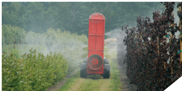
XXpire dries in 3 hours to minimize risk to beneficials and pollinators.